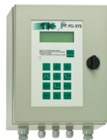
FG-SYS F, Digital Unit Wall Mounted Width: 200 mm, High: 250 mm, and Deep: 100 mm