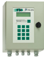
FG-SYS F, Digital Unit Wall Mounted Width: 200 mm, High: 250 mm, and Deep: 100 mm